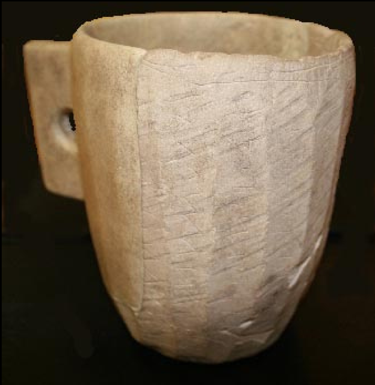
Cup, Jerusalem, 1 st century AD